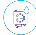
Overflow of Appliances