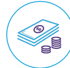
Loss of Rental Income