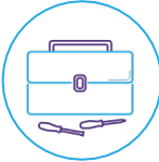
Wear and Tear