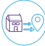
Off Premise Losses