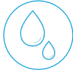
Water Backup of Sewer, Drain or Sump