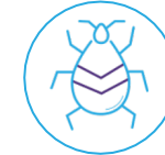
Bed Bug Remediation